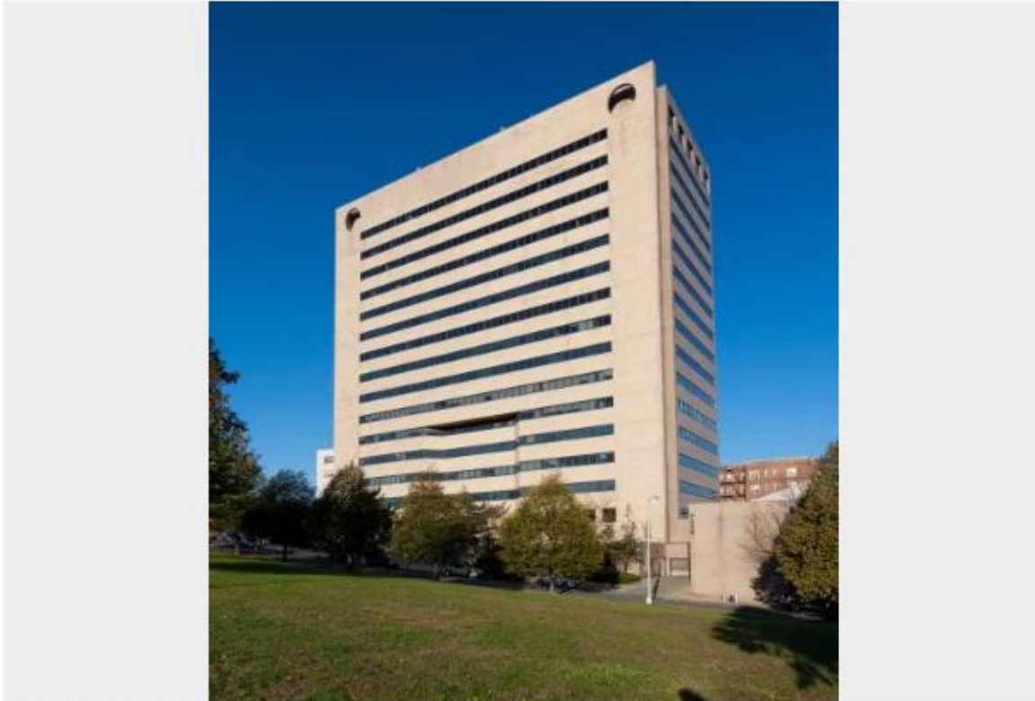
FOREST HILLS TOWER