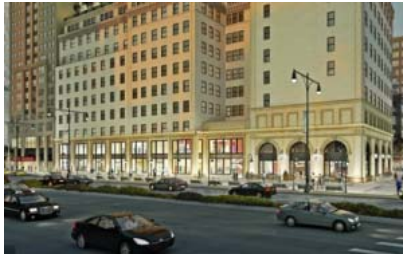
345 Adams Street